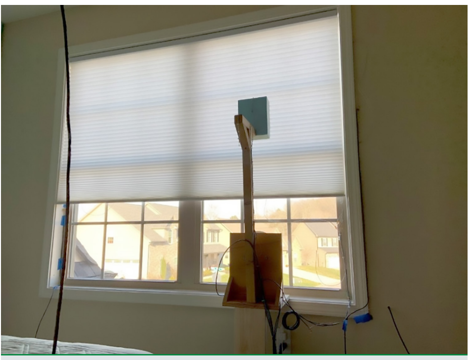
Cellular shade installed at ORNL's Yarnell Station house.

Right: The Attachments Energy Rating Council provides ratings like this for residential window attachment products so consumers can have independent and accurate information about the product's energy performance. All products with an AERC rating have been measured according to stringent standards and reviewed and accepted by AERC.