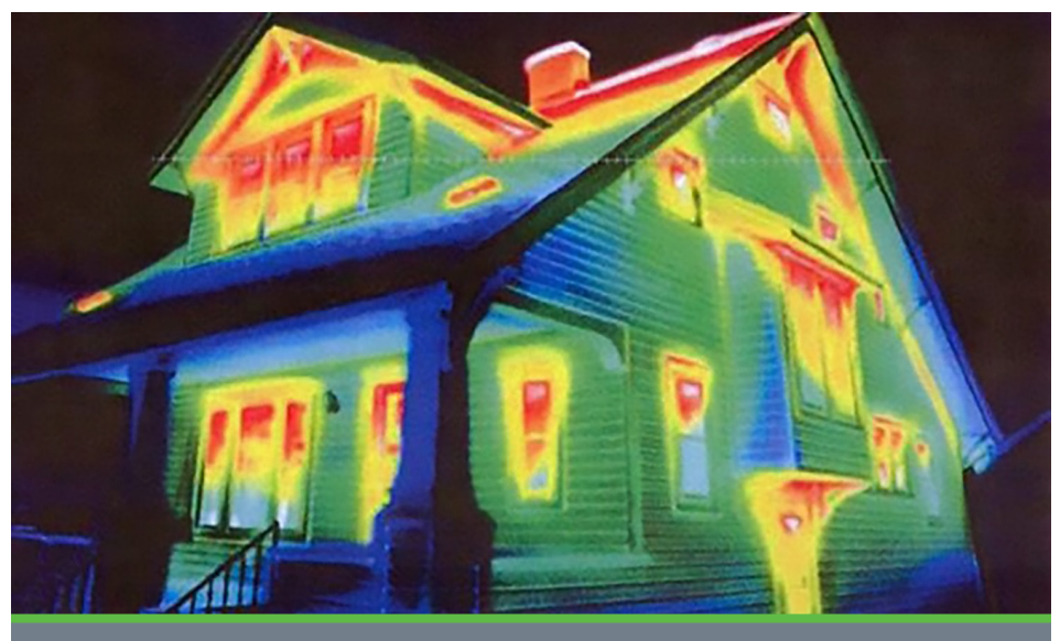
Example of windows as weak points in a home's energy efficiency.

At a fraction of the cost of window replacement, energy-efficient window attachments (e.g., interior and exterior shading, secondary glazing) offer a cost-effective and user-friendly way for consumers to save money yearround on their energy bills. Installing window attachments can save 15%<sup>4</sup> of a household's annual HVAC (heating, ventilating, and air cooling) energy use compared to vinyl blinds. High efficiency,